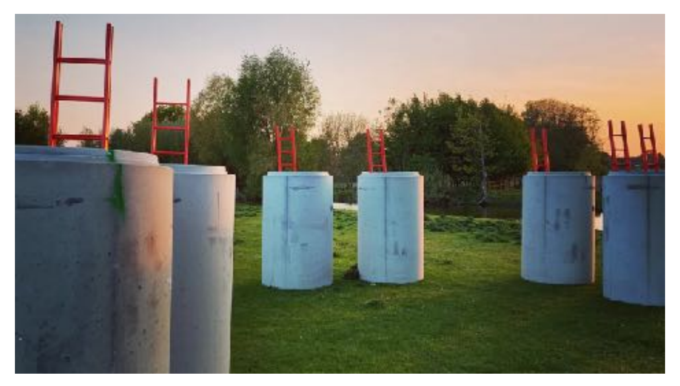
EDUCATIONS & WORKS