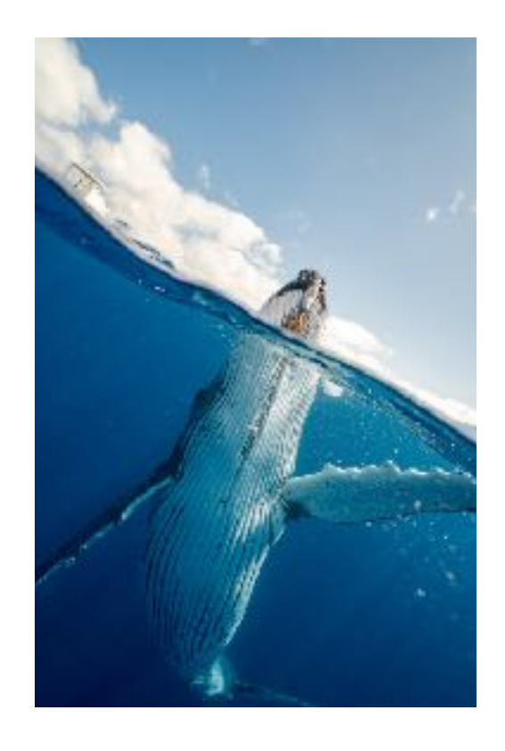
"The migration route of whales often follows the meridian line"

Immerse yourself in the feeling of light, grandeur and wonder.